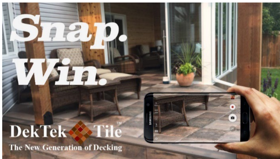
Photo Contest - Deadline October 1st, 2023

LOTS OF WAYS TO WIN!!! VOTING ON 7 CATEGORIES!!!